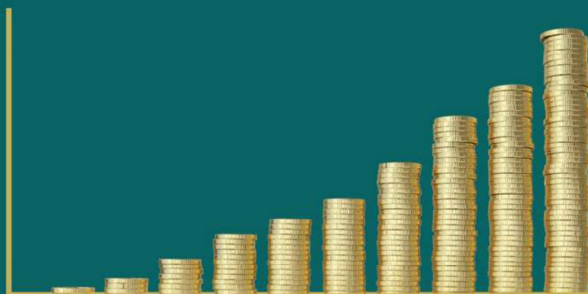
GROWTH LEVEL OF INVESTMENT